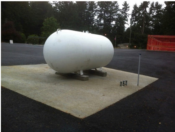
Burn pad and utility risers Propane control manifold

There are six concrete burn pads incorporated into the water capture basin, all supplied with propane and electrical service through underground lines. Five of these pads serve as the bases for various live-fire training props, such as vehicles, dumpsters, and pressure tanks. The sixth is a dedicated burning-liquids pool. The concrete construction of the pads and pool protects the surrounding asphalt from the heat of the burning props, and directs suppression water onto the capture basin for re-use. A typical burn pad is shown below, in Figure 2.