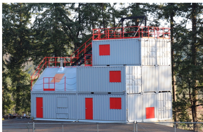
Figure 5. Live-fire and drill tower structure

As well, the structure is equipped with safety-rated anchor points and an engineered rappelling arch on the highest level for Technical High Angle Rope Rescue training and practice. Pick-off balconies and an exterior deck can be accessed from the arch, enabling a wide range of rescue evolutions.