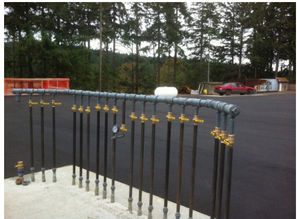
Figure 2. Figure 3.