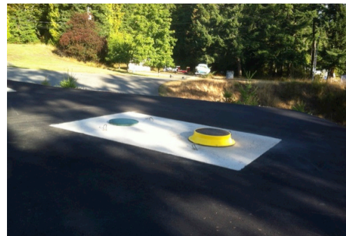
Figure 5. Training chamber

During construction of the training basin, a 2500-gallon (11.4 cubic meter) concrete cistern was installed below the finish grade level for use as a confined-space rescue-training venue. The cistern is fitted with two vertical access hatches and a 15-foot long by 3-foot diameter (4.6 by 0.9 meter) horizontal access tunnel. This configuration, along with movable surface props, enables a wide variety of safe, realistic simulation of cistern, cave, and structural collapse rescue scenarios.