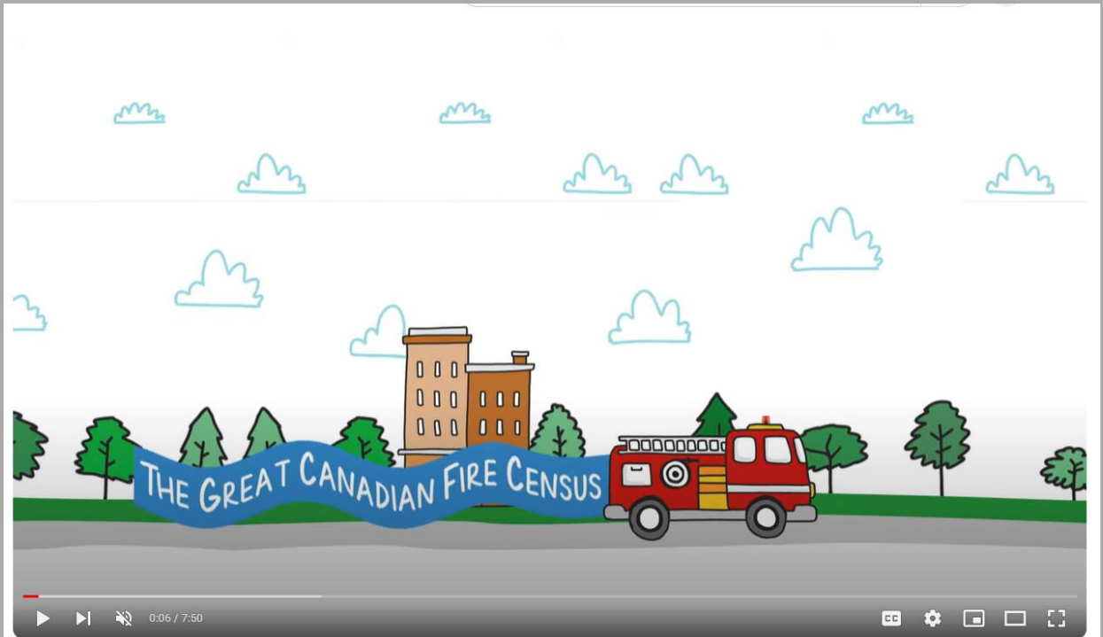
2022 Great Canadian Fire Census Graphic Illustration